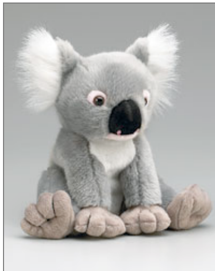
Koala plush toy by Wildlife Artists Inc.

The gift shops at the Palm Beach Zoo are now under the management of Wildlife Trading Company, a firm that manages retail operations at zoos, aquariums, museums, botanical gardens and other attractions across the United States. WTC has won recognition as the leader in retail operations for cultural attractions by developing the highest quality retail experiences for patrons. With a highly experienced retail staff, WTC continues to be the