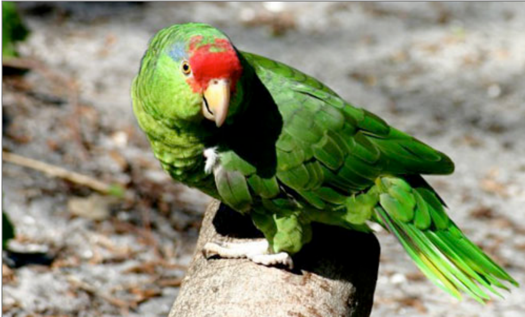
Chalupa Green Cheek Amazon Parrot